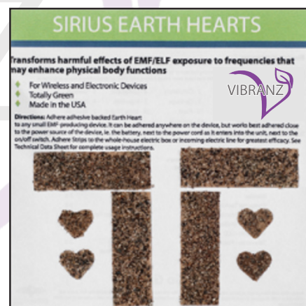
Sirius Earth Hearts: Home Package