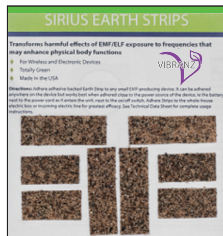
Sirius Earth Strips Package

This information has not been evaluated by the FDA and is not intended to treat disease, support human life, or to prevent impairment of human health. This information is for frequency, self-education and research purposes only. Please seek professional help with health issues. The products are not sold for these purposes. They are only sold to assist in bringing the energy field and centers into a greater sense of balance and coherence and any resulting physical results are antidotal at best.