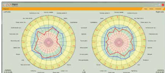
Before using Vibranz PET: Baseline diagram shows stress is 4.29

Emotional & Physical Realms Balance — Subject: Female, Age 59