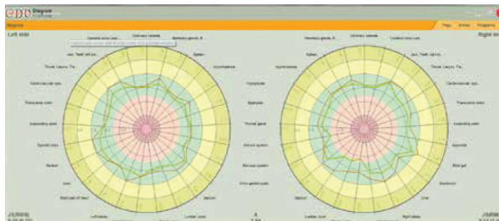
After using Vibranz PET: Baseline diagram shows stress is down to 2.84

GDV Diagrams show the balance between Emotional and Physical Realms and overall stress in the body on a scale of 1-10 – with 10 being the highest stress measure. The use of the PET in this research shows how the product changed the stress level in this individual from an above normal level of 4.29 to a normal average level of 2.84, thus reducing stress on the organs and systems and normalizing the space.